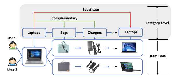
Figure 1: The hierarchical structure for two user sequences. Though the two users purchase different items in sequences, they have the same sequence patterns at the category-level and with respect to category-level item relations.

James Caverlee Texas A&M University caverlee@cse.tamu.edu